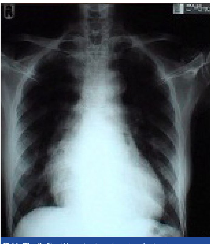
[Table/Fig-1]: Chest X-ray showing enlarged cardiac borders

alternately (3 ml), to attain a sensory level of upto T10. Total dose which was required was 10ml. After 10 minutes, the patient was positioned for surgery in supine position, on a surgical table. Intra operatively, epidural infusion of bupivacaine 0.5% was started, at a rate of 5ml/hr. Inotropes (dobutamine, dopamine) were used. A vasopressor, phenylephrine, was kept ready, but it was not used, as there was no drop in blood pressure. Intraoperatively, blood loss was assessed by collection of blood in suction bottle and the soaked gauze pieces and same was corrected by transfusion with packed cells. The total duration of the surgery was approximately 90 min. No significant changes were observed in blood pressure and heart rate. Post-operatively, blood pressure was maintained, there were no complaint of chest pain, sweating or dyspnoea. Post-operative complications were not remarkably noticed, and the patient was discharged. The patient was advised regular OPD follow ups, which were well taken care of accordingly.